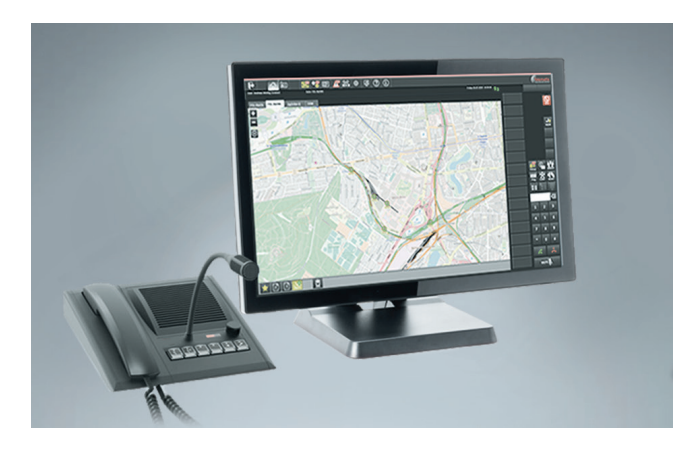
Flexible Dispatcher solution SBG Te23

The Kontron Transportation Next-Gen Dispatcher solution is based on a future-proof MCx server/client architecture according to the 3GPP standard, which is an FRMCS enabling technology.