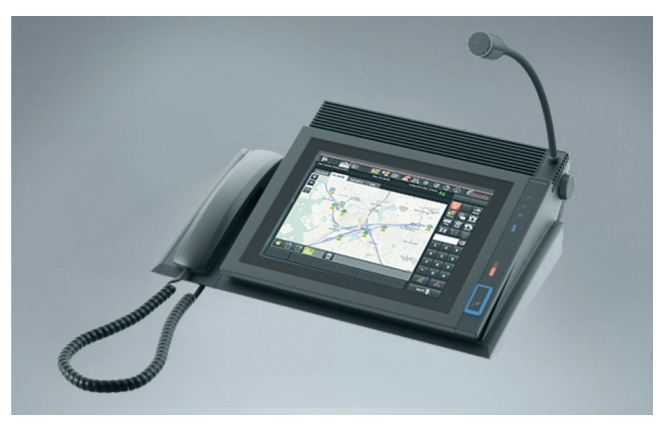
Integrated compact Dispatcher terminal SBG Ti10

The MCx implementation is built on an IMS-based SIP core, a Dispatcher application server and a convergent rail application server with MCx and GSM-R functionality. This enables seamless interconnection and interworking between GSM-R and FRMCS. Thanks to this architecture, existing Kontron Transportation GSM-R R4 networks with fixed and mobile GSM-R subscribers can be converged into GSM-R, MCx and FRMCS networks.