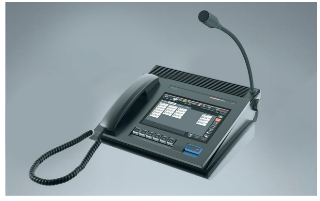
Compact Dispatcher solution SBG Ti7

FRMCS terminals, such as Next-Gen Dispatcher solutions can be used alongside GSM-R terminals, such as fxed GeFos. Thus migration possibility and investment security is given.