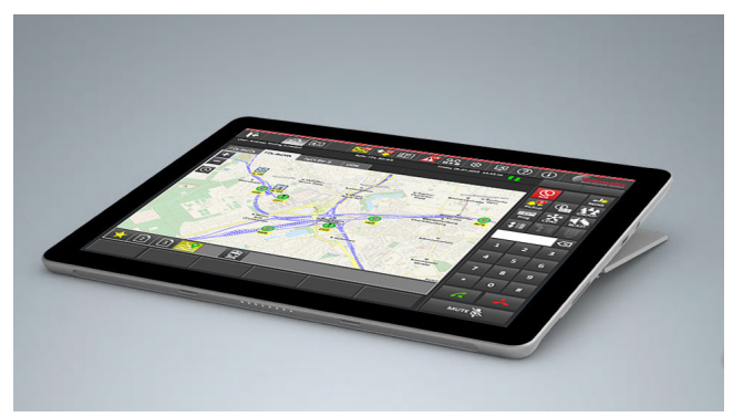
MBG 10 Dispatcher tablet

FRMCS REC alerting allows the Dispatcher to take control of alerting areas. Alerts such as REC are distributed intelligently only to affected vehicles and participants in alert areas. The Kontron Transportation Next-Gen Dispatcher supports alerting areas that can be defined for any desired geographical level and shape.