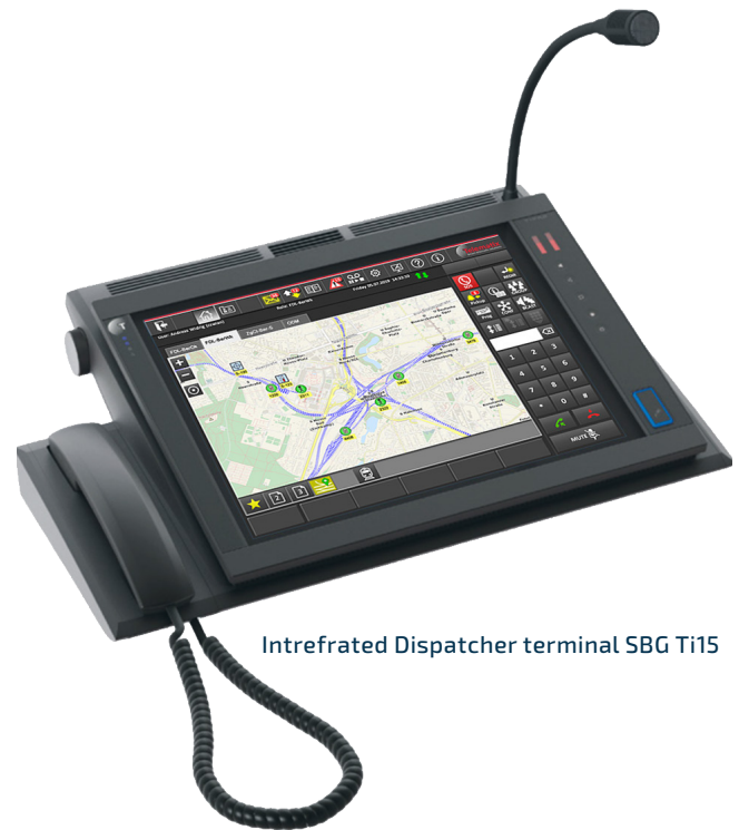
Intrefrated Dispatcher terminal SBG Ti15

Kontron Transportation works with the same manufacturer as in many GSM-R projects with major railroad companies. This enables the biggest possible security to comply with all GSM-R specifications and features.