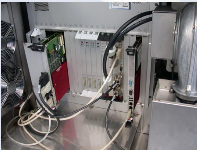
The CP605 CompactPCI CPU card that controls the laser printer essentially corresponds to the standard version

Despite the high performance, passive cooling is sufficient for all processor variants. This enables the mechanically precise design solution for the processor/chipset cooling bloc. Cleverly designed thermal management prevents the processor from overheating and ensures trouble-free operation of the CP605, even under unfavorable housing and system conditions. Integrated into the Pentium 4 is an on-die sensor, which controls the temperature and reduces the processor frequency depending on the measured values. Furthermore, Kontron has equipped the board