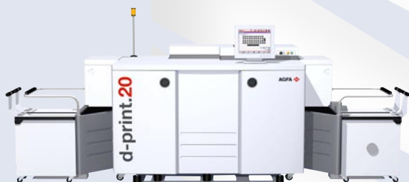
High-performance printer d-print.20 with CPU-Boards from Kontron.

Above all, the performance of the board is demonstrated by the speed with which the memory is accessed. The highly integrated Intel 845GV chipset, designed for the Pentium 4, provides a frequency of 400 or 533 MHz on the DDR-RAM for maximum data throughput. The board supports up to 2 GB RAM, of which up to 1 GB is soldered and can be enhanced with up to 1 GB through a 200 pin SODIMM slot. For communication, the CP605 CPU board has three Ethernet channels, of which two are Gigabit Ethernet and one is Fast Ethernet, plus five USB ports, three being USB2.0.