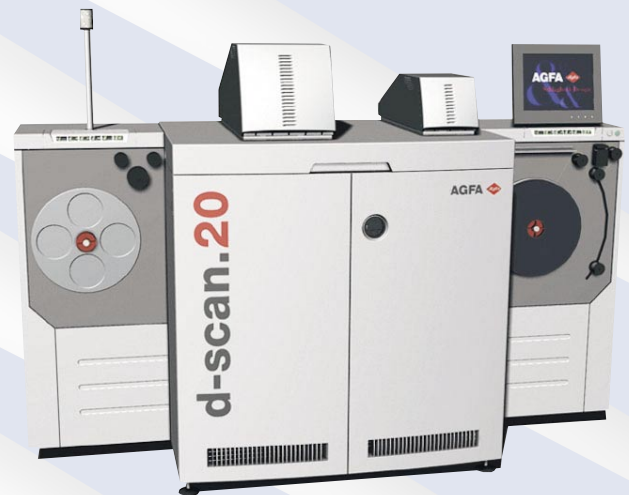
The high performance of the scanner d-scan.20 is due to Kontron's CPU-Boards

In order to meet the end user's expectations in terms of picture quality, the image data is processed in the d-ws using a special image processing algorithm. It is also possible to reduce the annoying "red eye" effect and to reproduce skin tones that are "warmer" or "colder" according to taste.