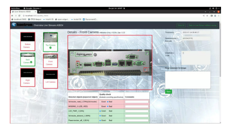
Figure 4. The visual inspection solution provides a human operator with an assessment of whether (green highlighted) or not (red highlighted) the detected objects match the specification, who can verify any issues.

Solution Brief | Kontron and Intel Develop Advanced AI-based Visual Inspection that Boosts Quality Assurance for Manufacturers with Small but Broad Product Line