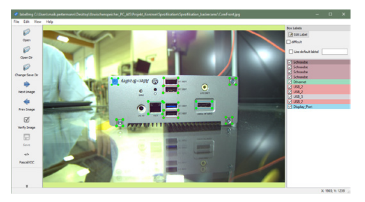
Figure 2. Objects of interest were labeled to generate a representative dataset of images for each type of PC, including components and missing or defective parts.

"In order to increase the accuracy of the model, i.e., how well an object is recognized, we used techniques such as augmentation—rotating images a few degrees, using different brightness values, cropping, and padding, as well as even mirroring techniques," Dreyer explains. They also had to augment the data set to obtain a sufficiently large number of distributed objects and experiment with different learning models and methods, like transfer learning using models from the OpenVINO Model Zoo, to determine what would work best.