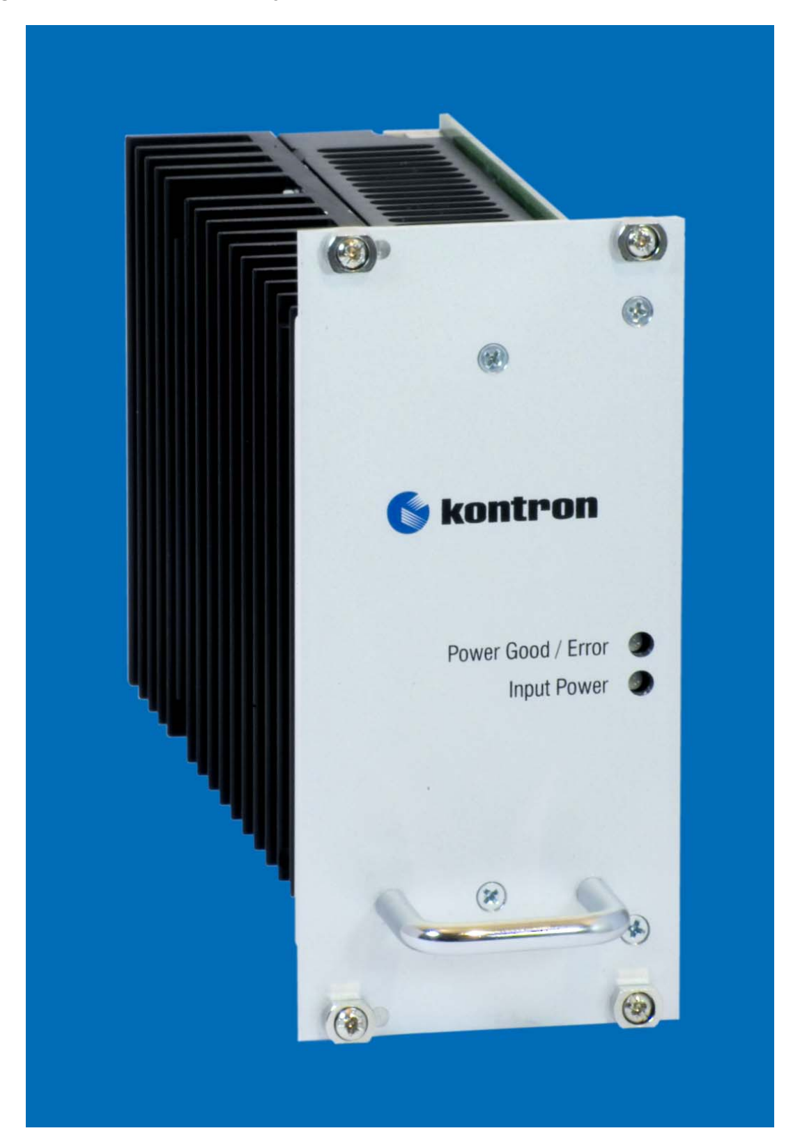
Figure 1: View of Power Supply Unit CP3-SVE-M100DC