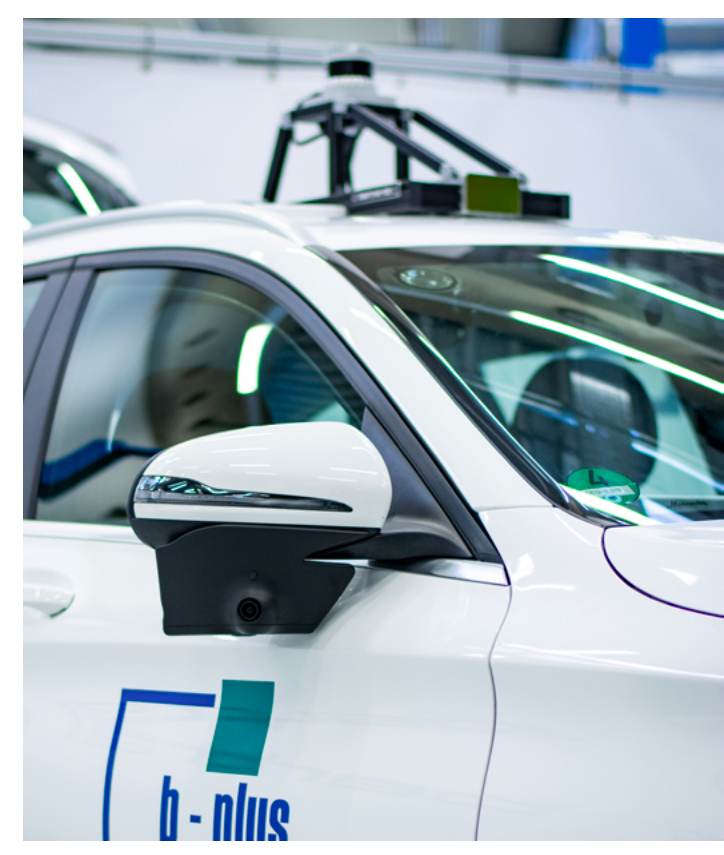
// Test vehicle for autonomous driving

In the current test phase of such vehicle the volume of data is especially high. The BRICK technology not only helps to manage the data that is being generated, but also ensures its quality: for example, it is by no means self-evident that the data is synchronized and stamped with the right time at the level of fractions of a second. Above all, the requirements also include considerable computing power, which must be scalable in the future. Smaller ARM processors are not sufficient for evaluating the immense data volumes surrounding radar, LiDAR and camera sensors; instead, the highest performance class of processors is required.