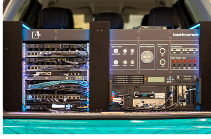
// Experimental setup in the test vehicle