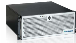
KISS 4U V3 ADL