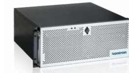
KISS 4U V3 CFL