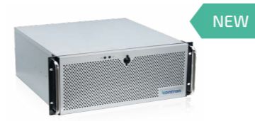
KISS 4U V4 RPL