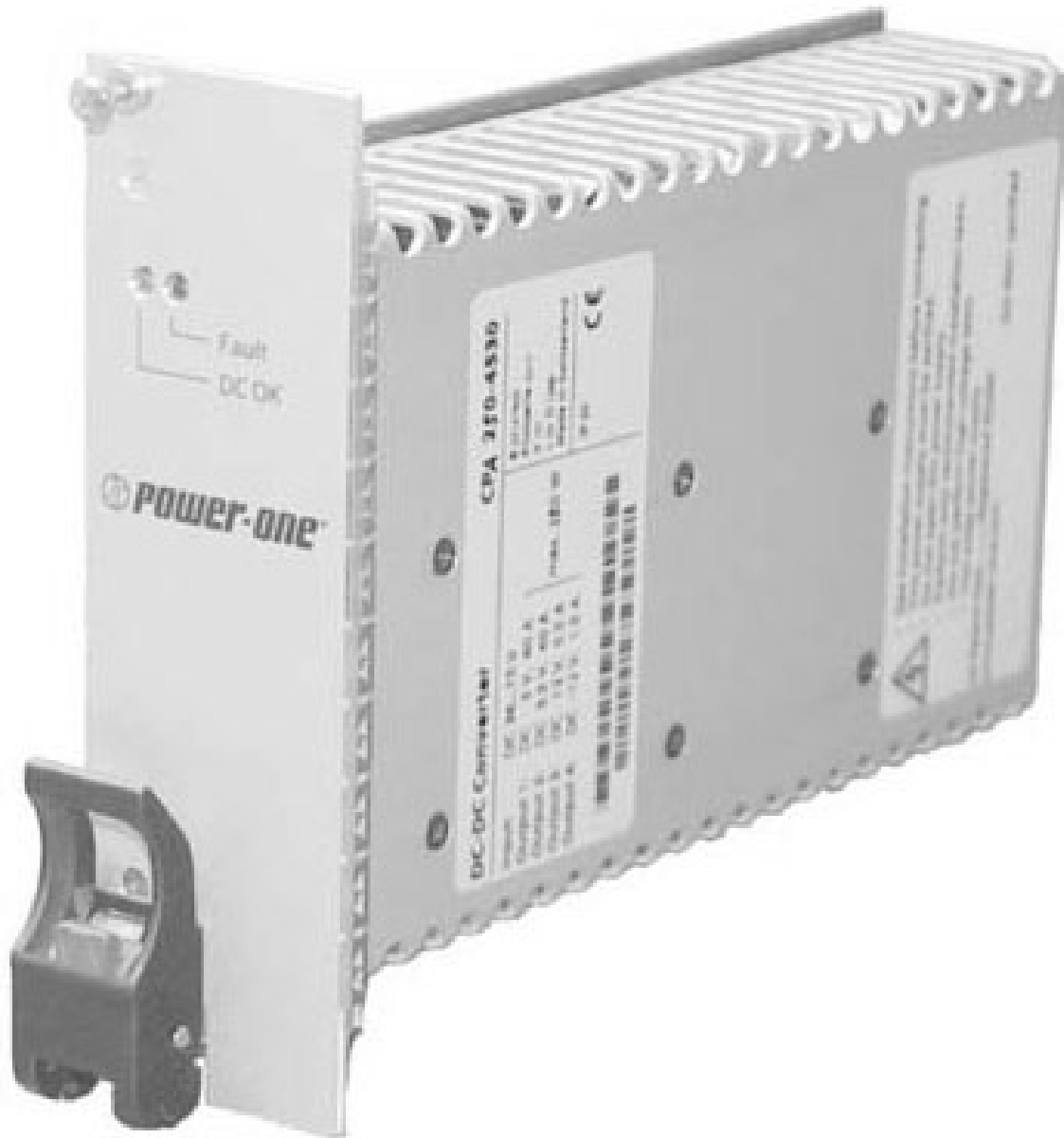
Figure 1: View of Power Supply Unit CP3-SVE-P200DC