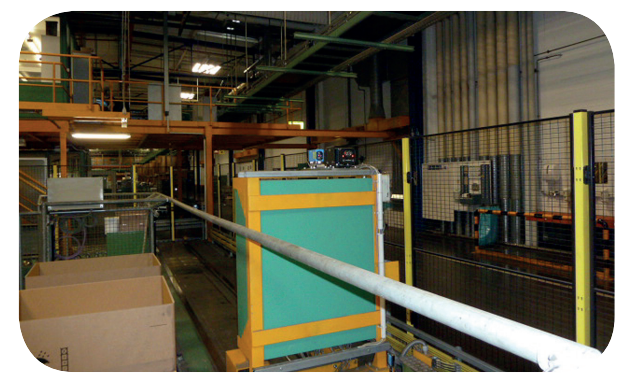
In the automatic warehouses, transfer carriages are responsible for automatic storage and retrieval of car spare parts. With the new positioning system from PSI Technics the availability of the system and the positioning precision are further secured.