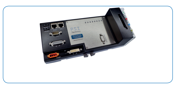
Picture 1: The control unit of the Positioning Solution System offers all the usual interfaces needed for connecting to the company's IT, processing computers or PLC as well as a scalable number of I/O modules for direct connection to distance meters like lasers, incremental encoders or barcode readers.

The Positioning Solution System is a control unit in the form of a compact industrial PC, which provides numerous interfaces and connecting modules which are conform to industry standards (see picture 1) and a communication interface and